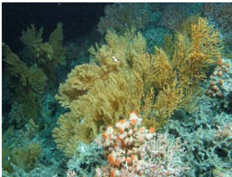
Deep sea ecosystem